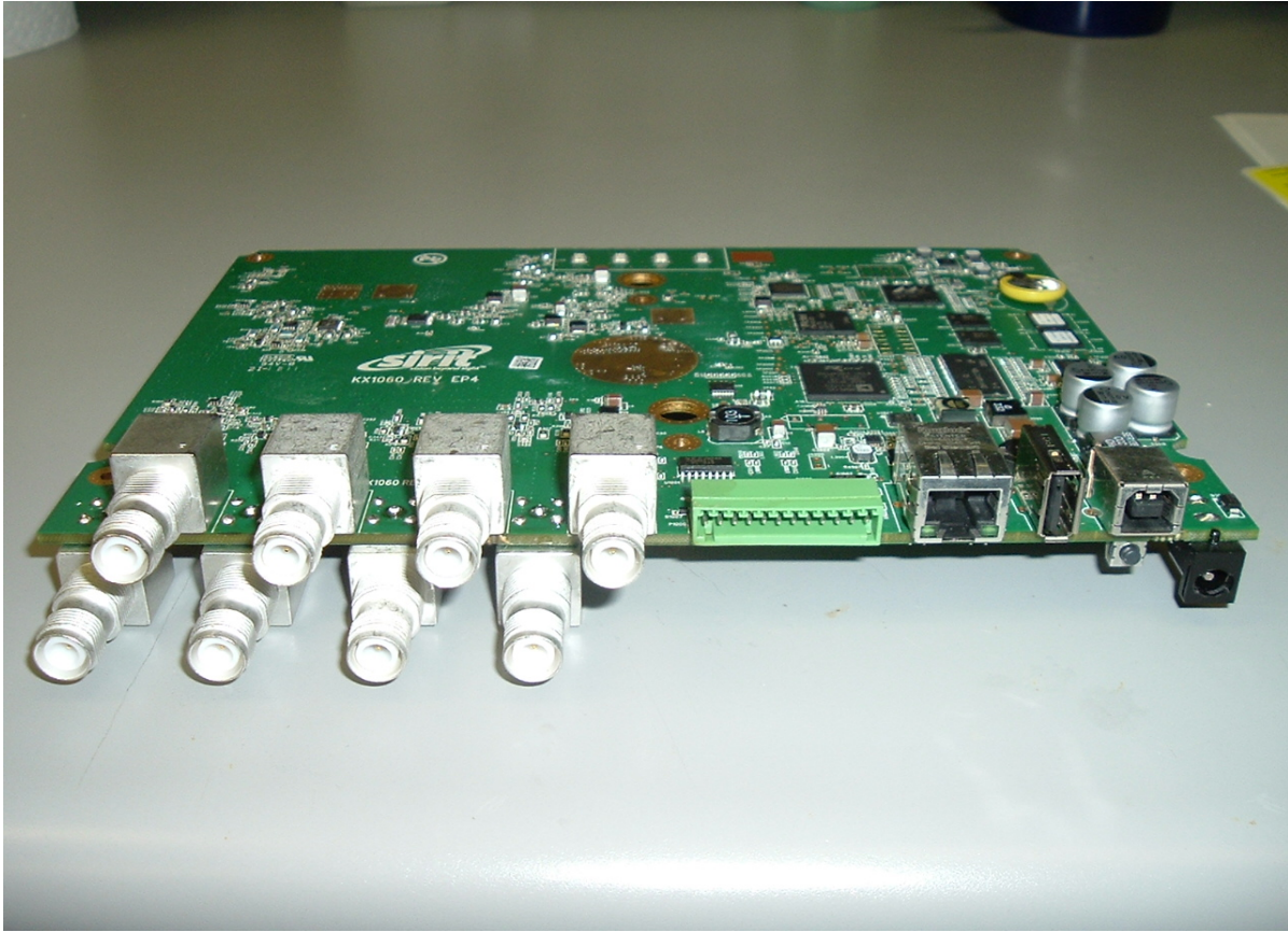
Printed Circuit Board, Connector Side