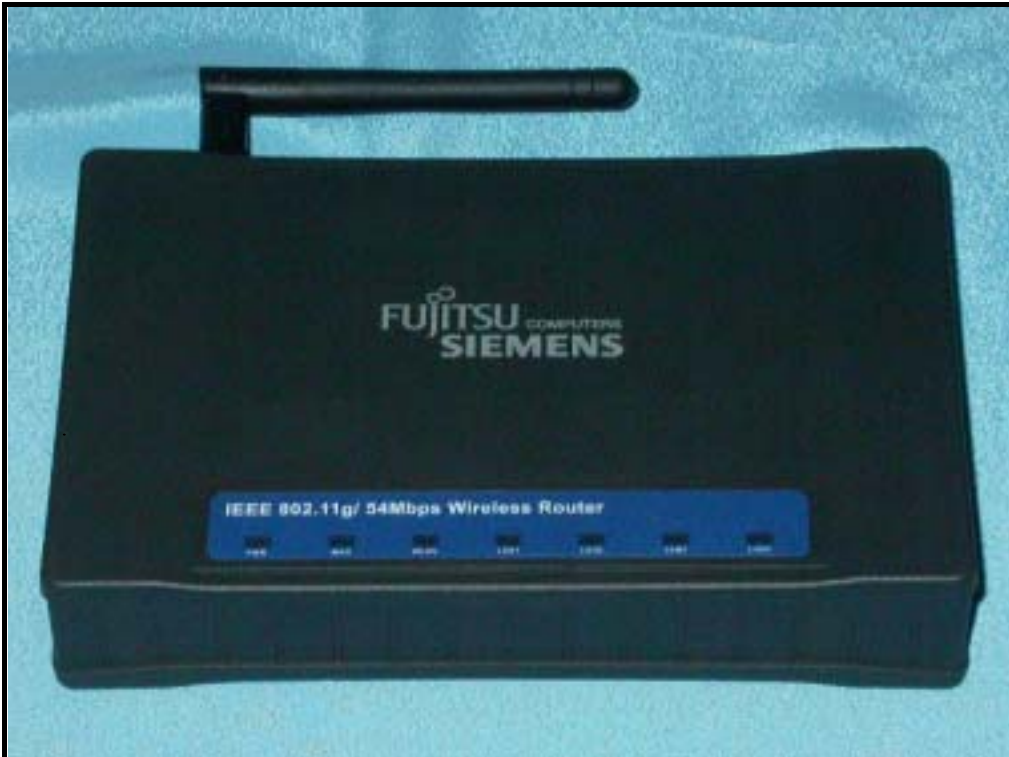
XG-2000 black case (Before)

(2)The difference is change of the case.