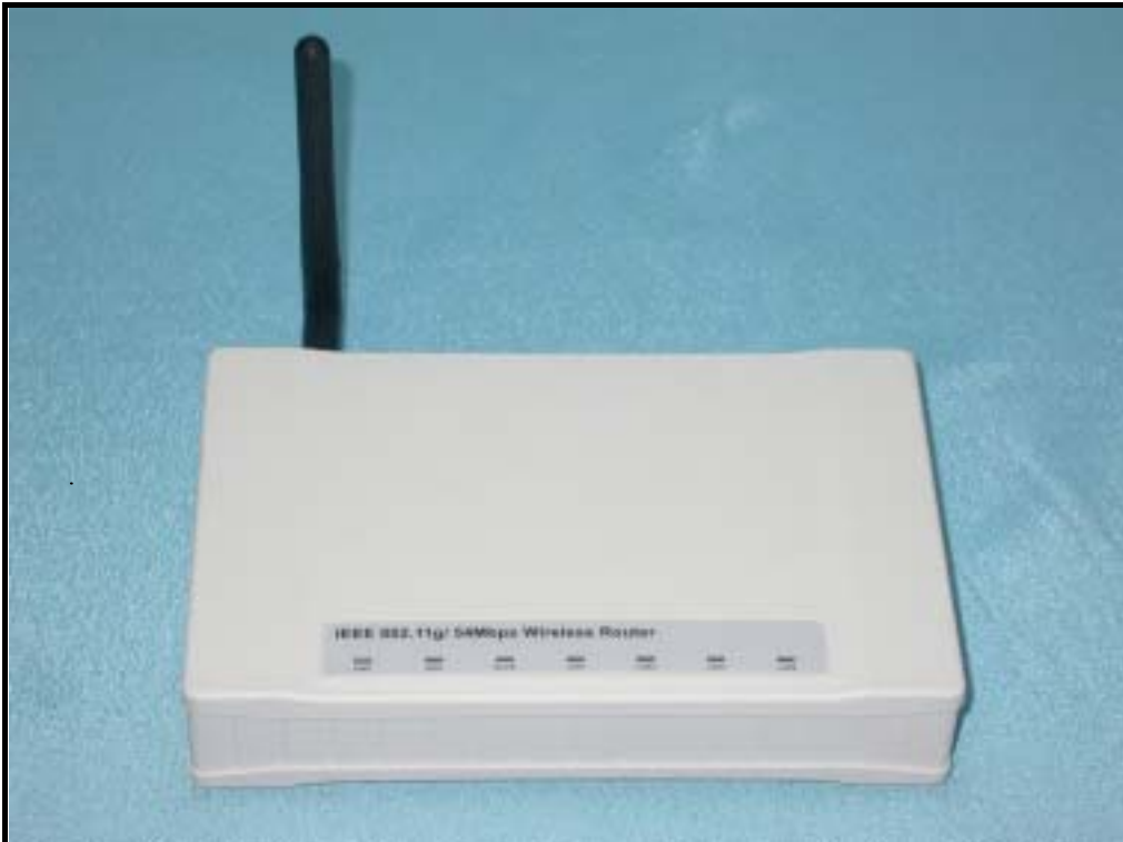
XG-2000 white case (After)