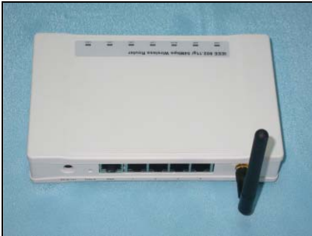
XG-2000 white case (After)