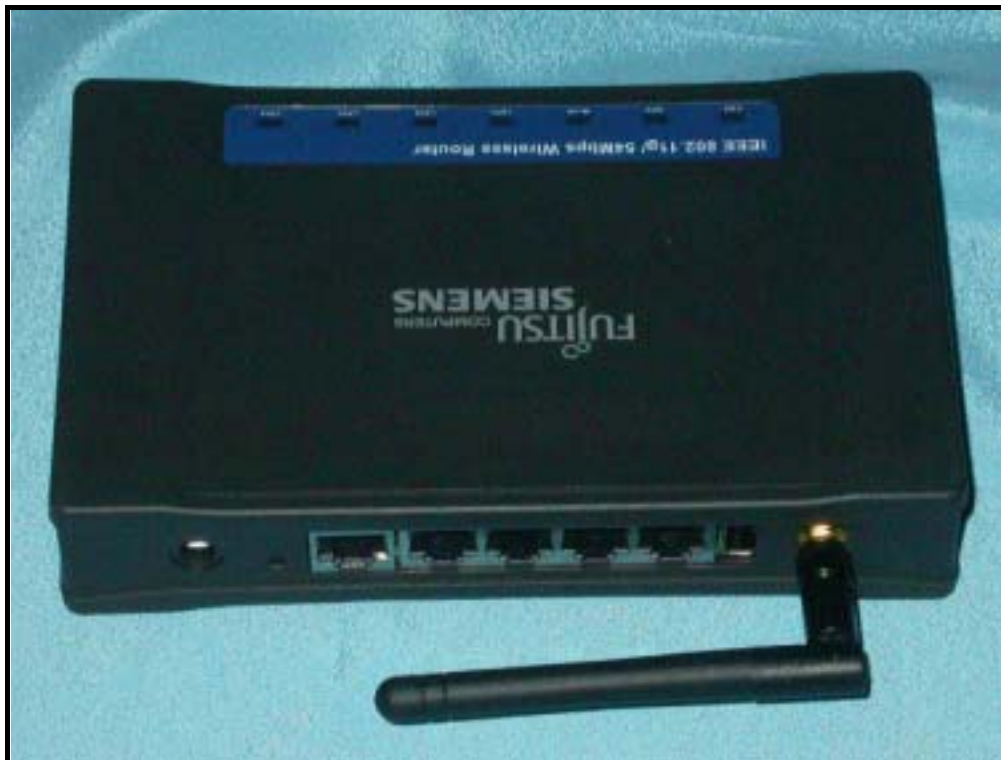
XG-2000 black case (Before)