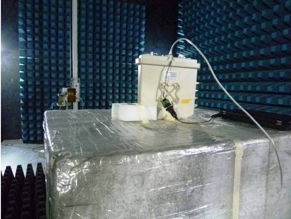
Radiated Emission Set up Photos (Front View)