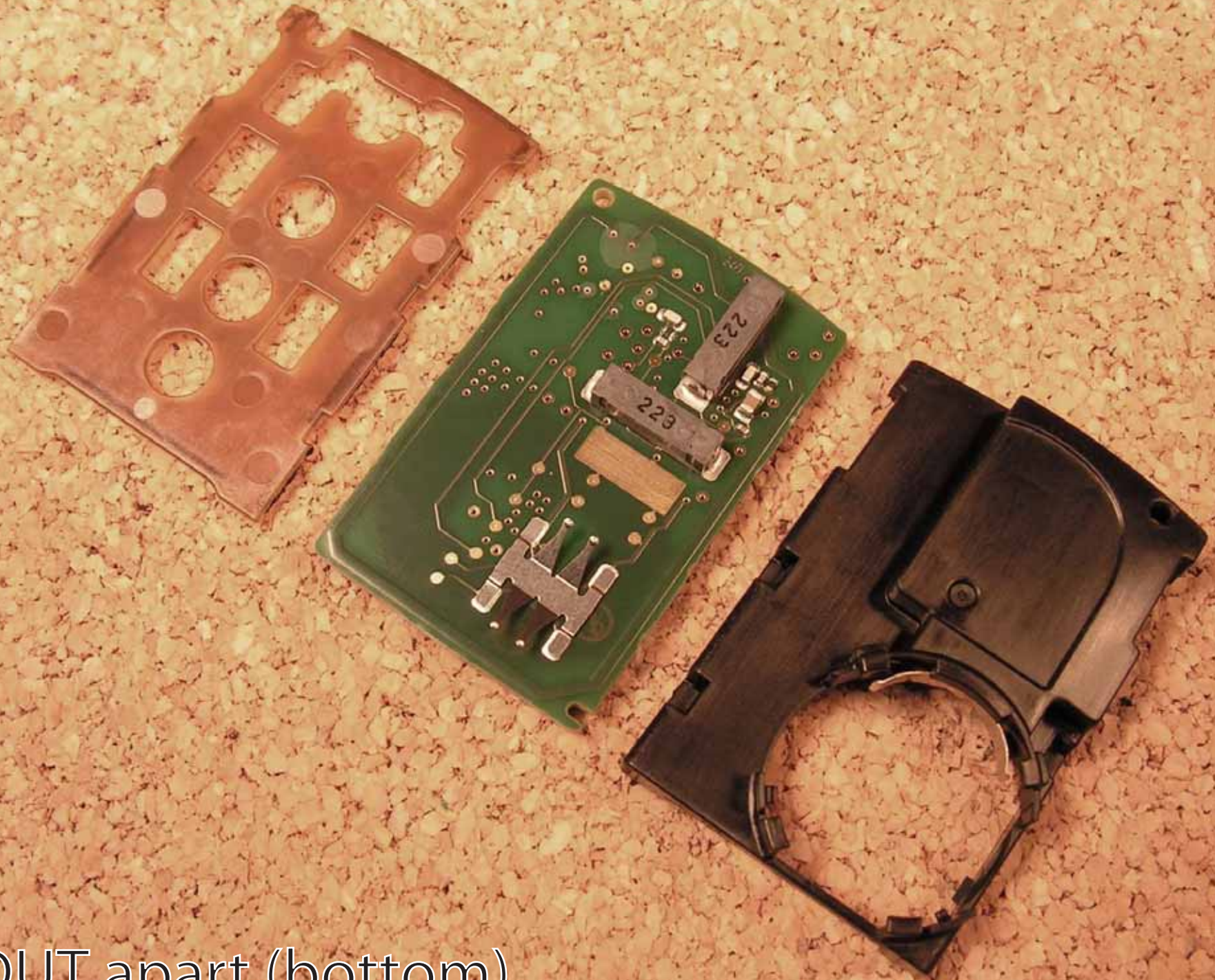
DUT apart (bottom)