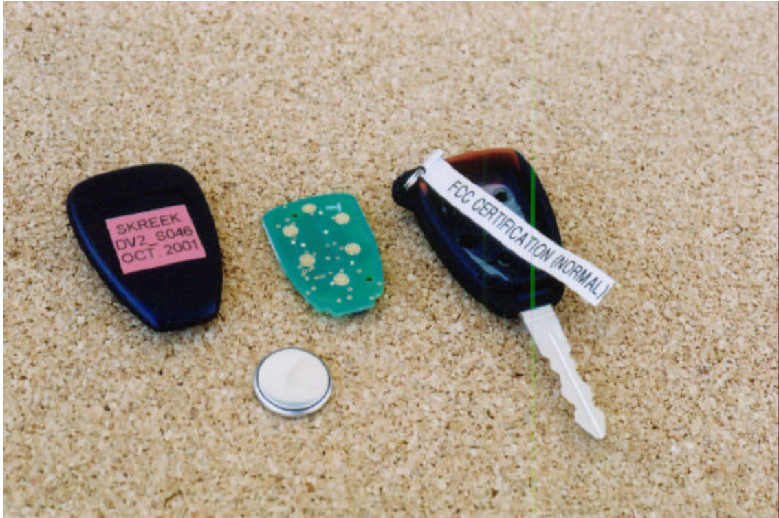
5WY72XX Transmitter – Case Open