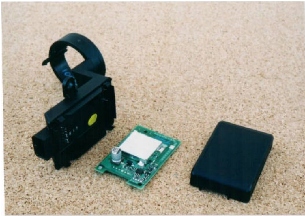
5WY7078 Immobilizer– Case Open Bottom