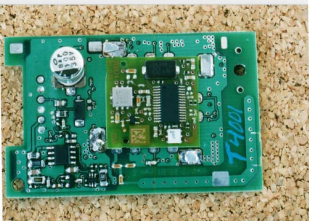
5WY7078 Immobilizer – PCB Top w/o Shield