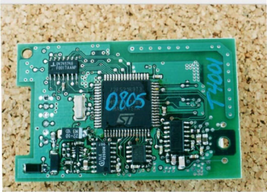
5WY7078 Immobilizer – PCB Bottom