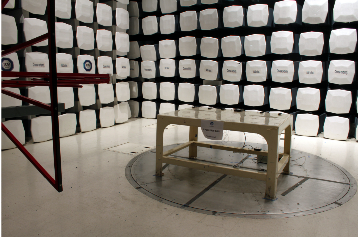
Radiated Emissions Test Setup (30MHz to 1GHz)