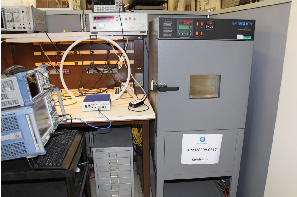
Frequency Stability/Voltage Variation Test Setup