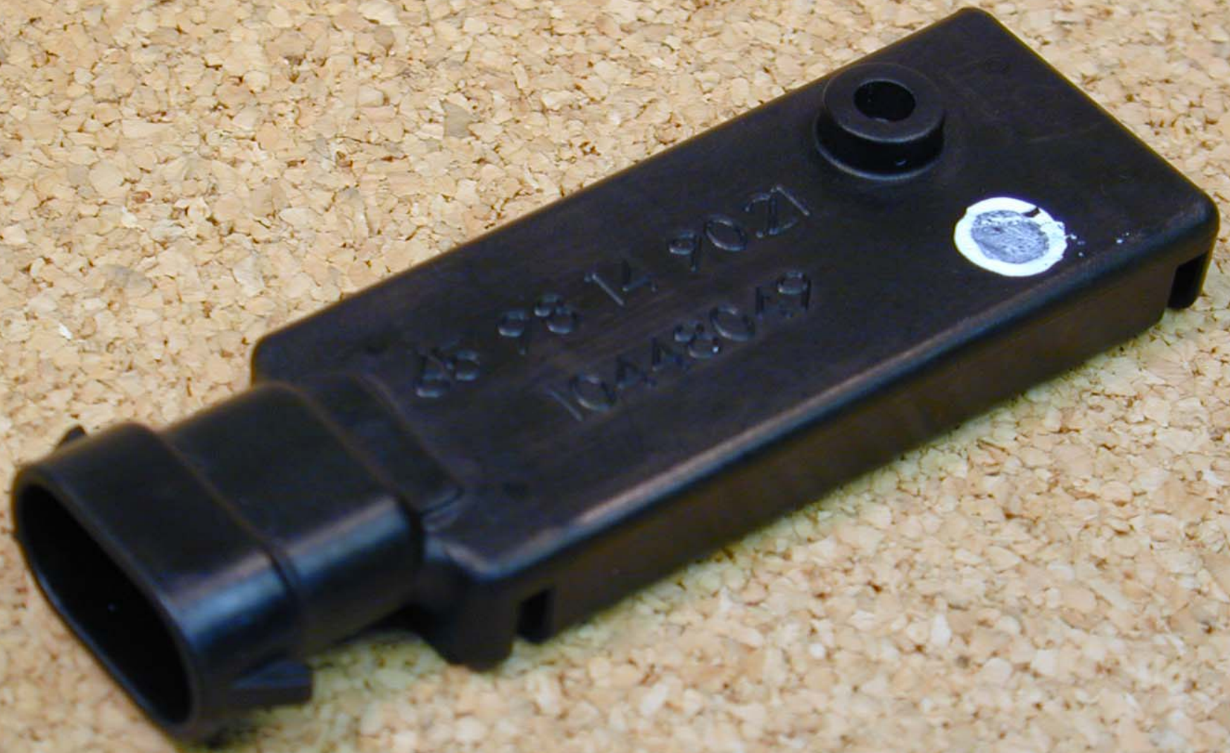
DUT actuator coil (bottom)