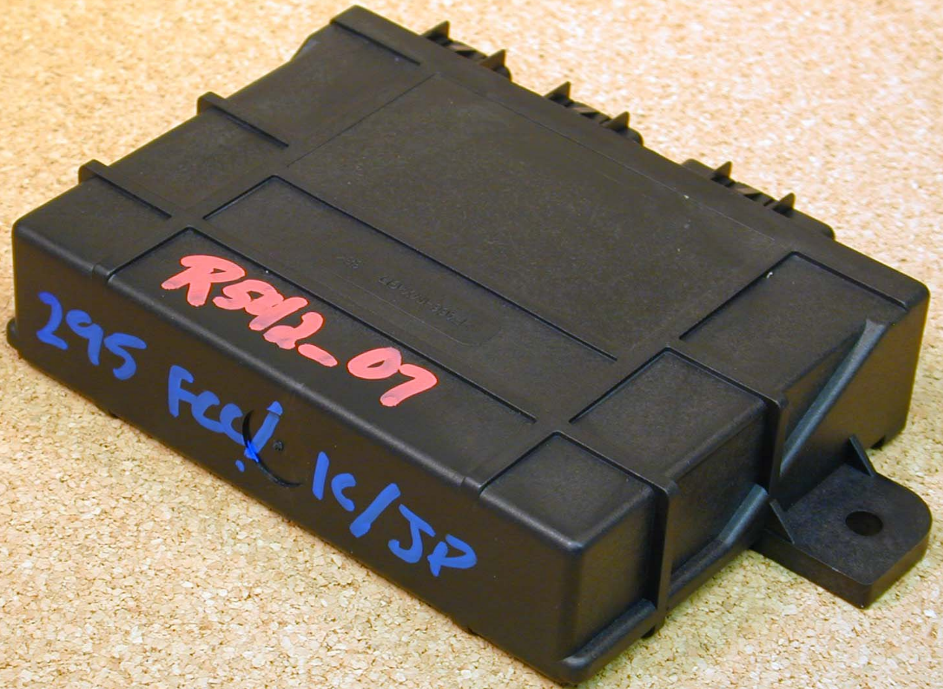
DUT Control Box (top)