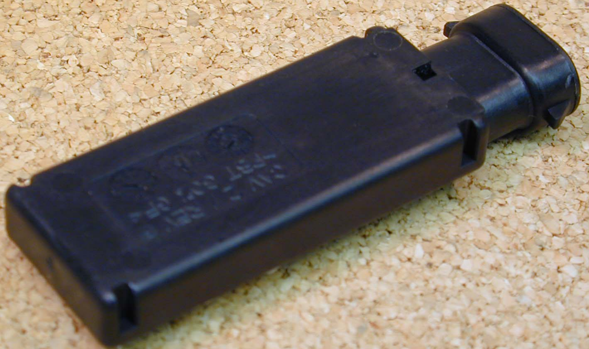
DUT actuator coil (top)