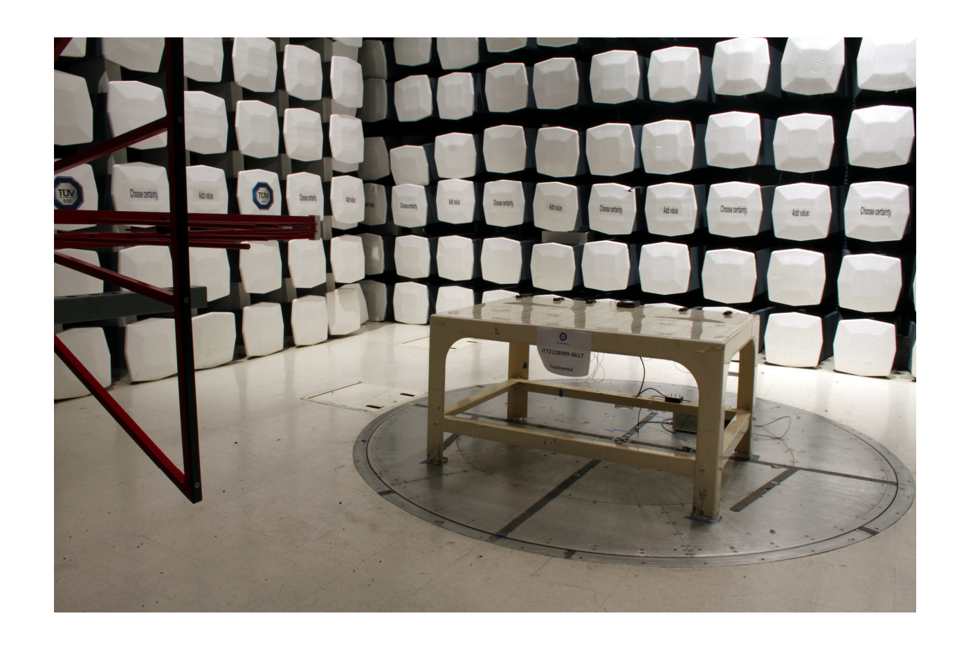
Radiated Emissions Test Setup (30MHz to 1GHz)