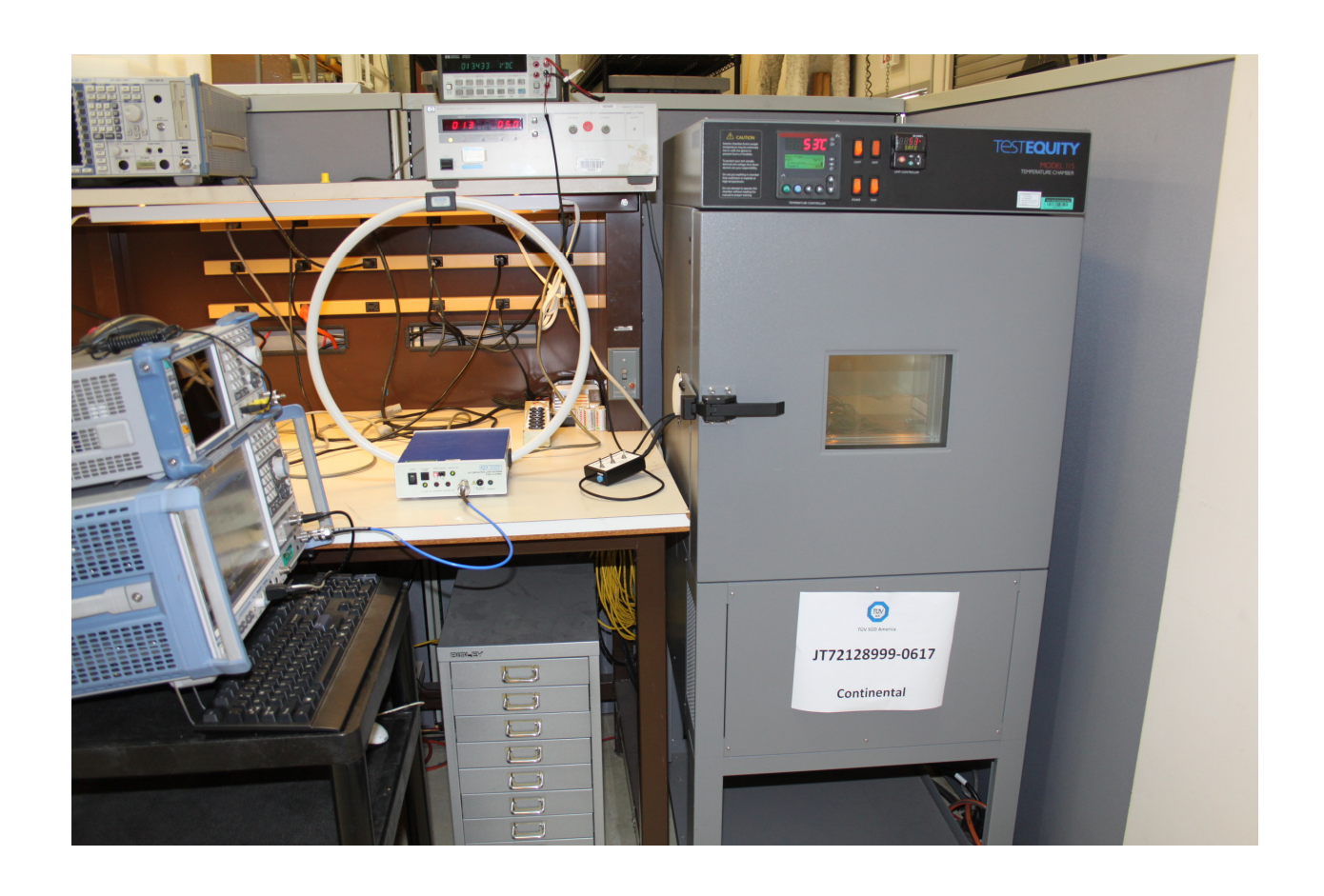
Frequency Stability/Voltage Variation Test Setup