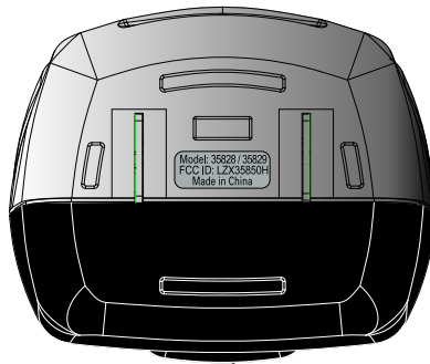
35828/29 HS FCC Label

35828A/35819 HS FCC LABEL LOCATION DATE: 07-JULY-2004