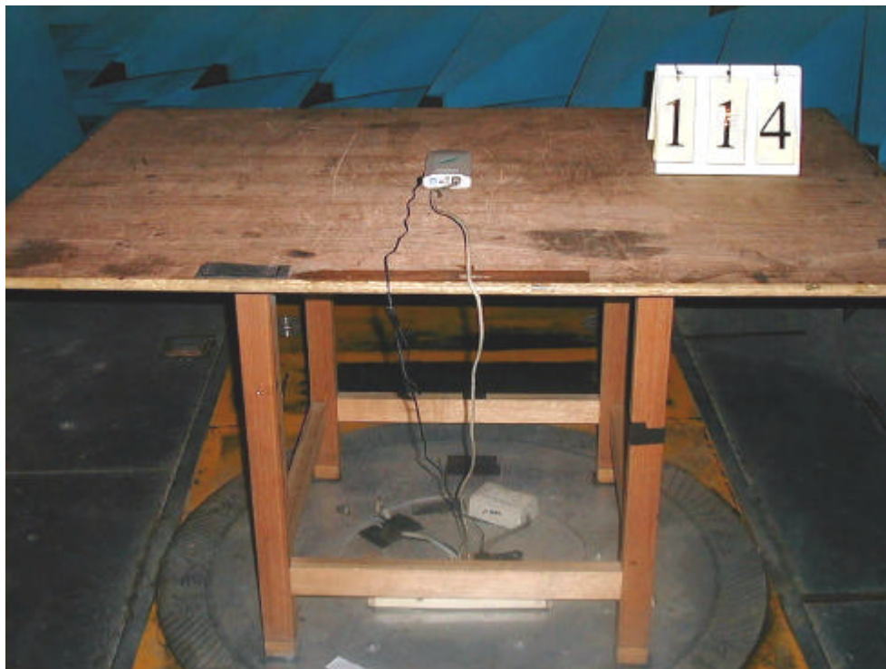
Rear View of the Test Configuration

The test configuration for frequency between 1GHz to 18GHz is same as above.