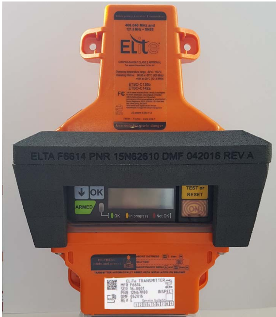
ELiTe in Survival configuration (ELiTe TRANSMITTER equipped with ELiTe Float) photos: