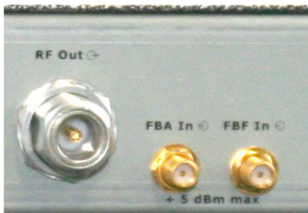
Fig. 1 Rear panel

These signal levels should be in the range of -15 to -5 dBm.