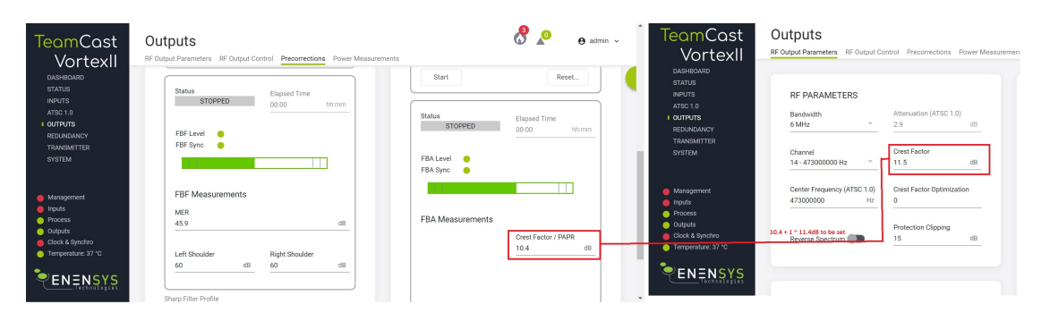
Fig. 3 Non Linear Precorrections screen followed by the RF Output Parameters screen

correction has run, it should be adjusted down by 1dB from where it is set to see if there is a performance impact. If not, then leave it alone. It should only be carefully increased in small increments to see if increasing has any positive effect on signal performance. Essentially, it should be adjusted only as high as necessary to achieve acceptable performance.