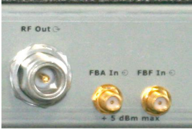
Fig. 1 Rear panel

These signal levels should be in the range of -15 to -5 dBm.