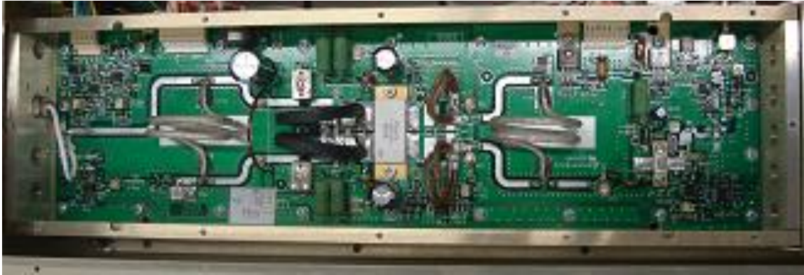
50W Multistage VHF Amplifier