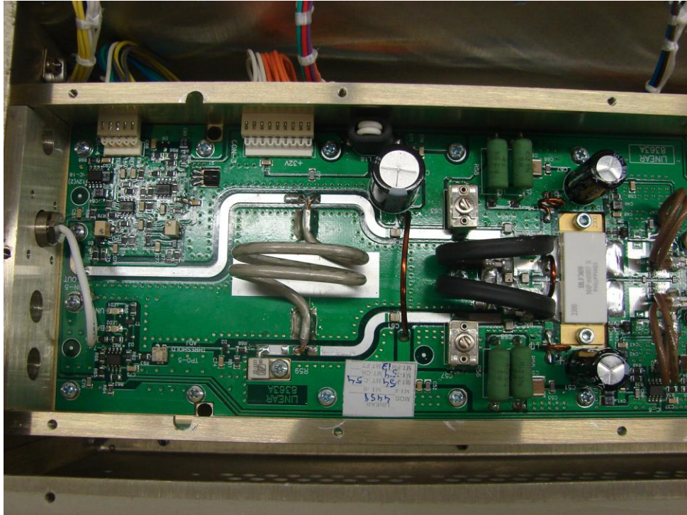
50W Multistage VHF Amplifier – RF Output Circuit Matching