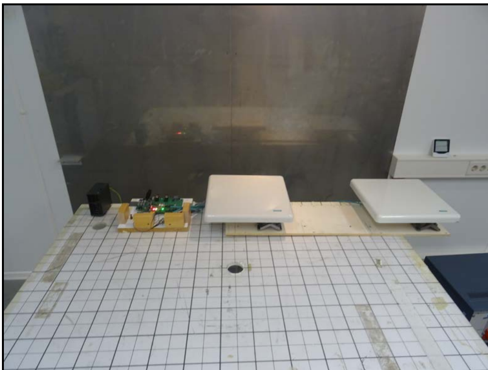
Photo 1:EUT- MIMO PORT 1+2+3+4 (No Port Terminatd with 50 \Omega )