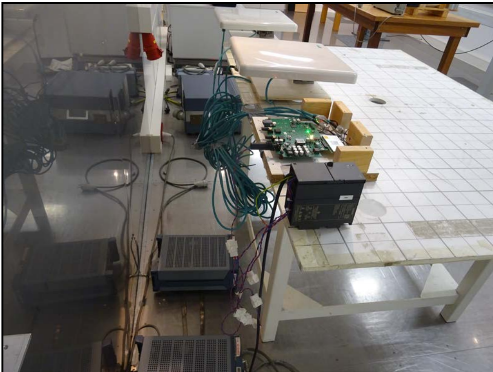
Photo 4:EUT- MIMO PORT 1+2+3+4 (No Port Terminatd with 50 \Omega )