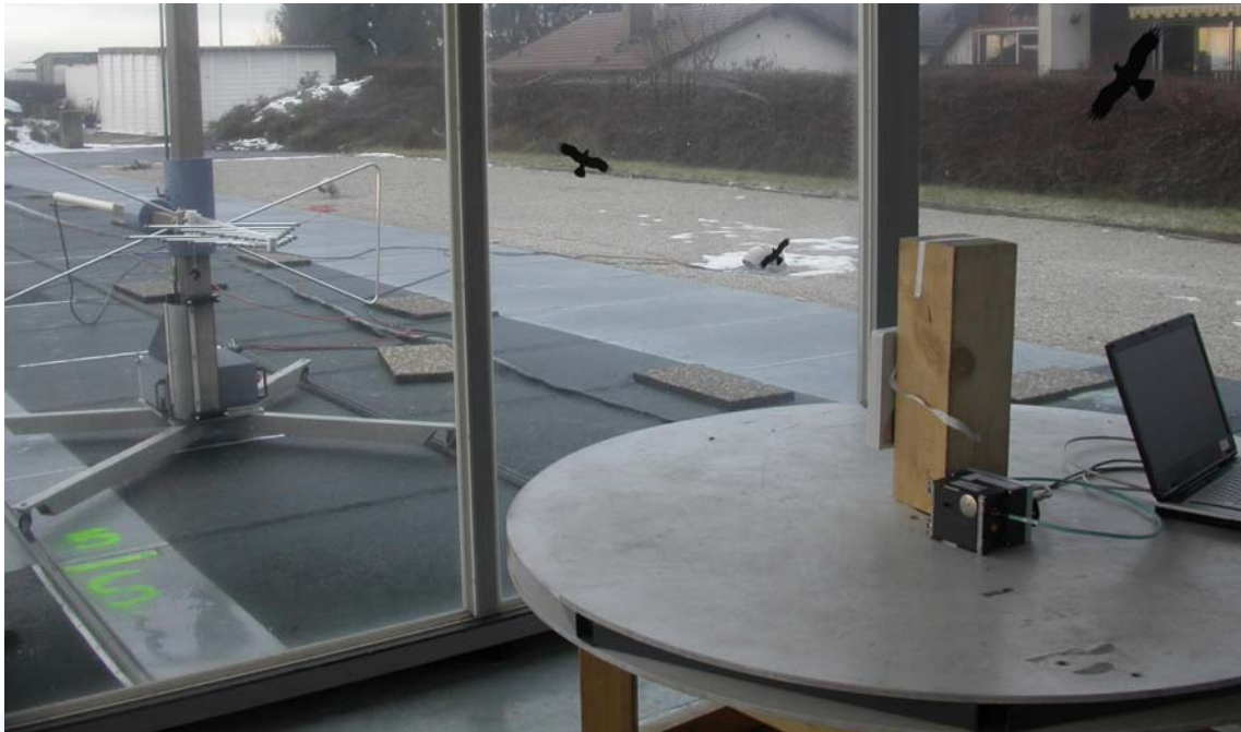
Open area test site