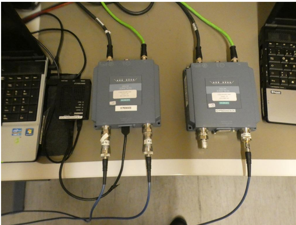
Photo 2: Test setup conducted DFS tests, EUT detail (left EUT used as DFS Master).