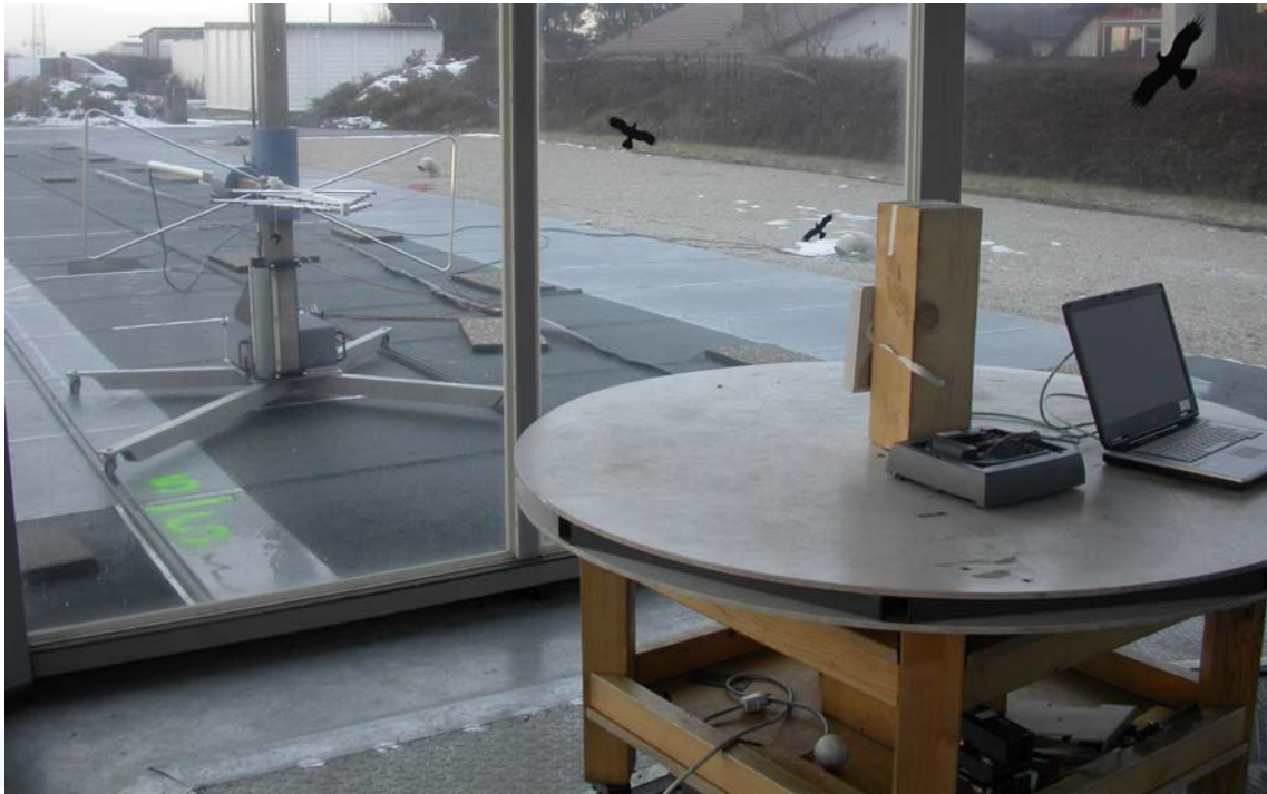
Open area test site