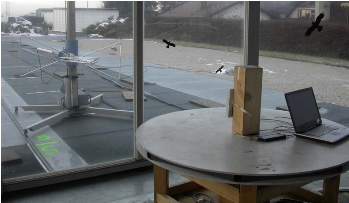
Open area test site