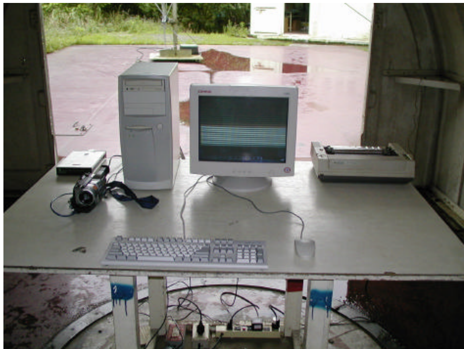
Radiated Emission Setup Photos (Worst Emission Position)