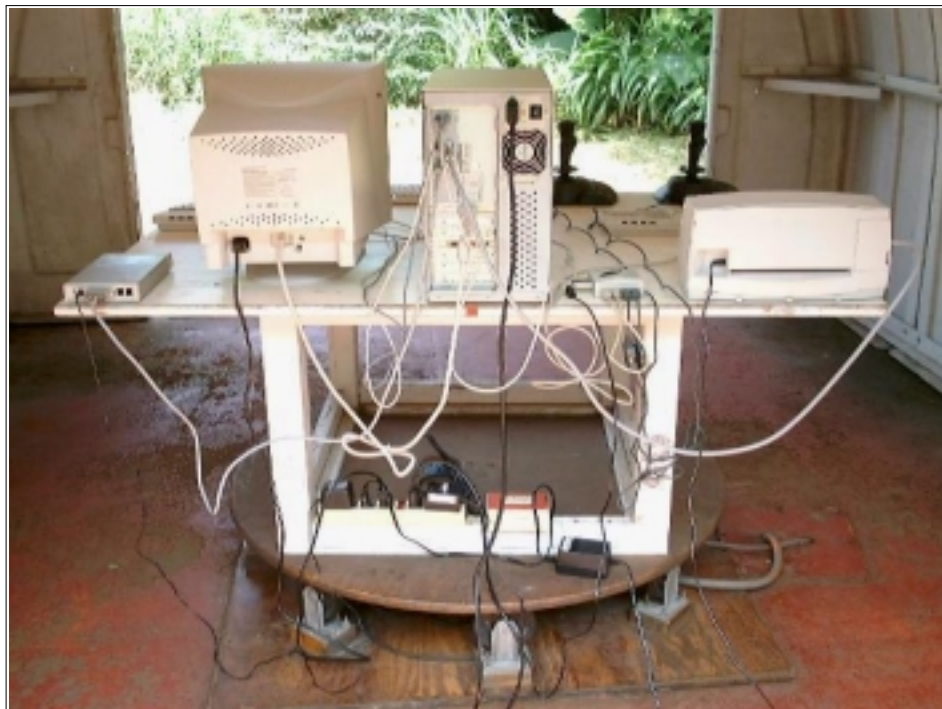
Radiated Emission Setup Photos (Worst Emission Position)