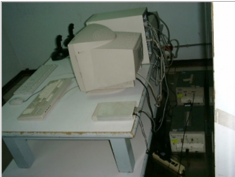
Conducted Emission Setup Photos (Worst Emission Position)