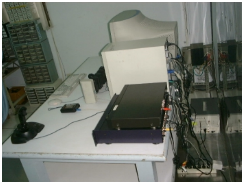
Conducted Emission Setup Photos (Worst Emission Position)