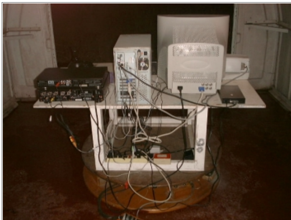
Radiated Emission Setup Photos (Worst Emission Position)