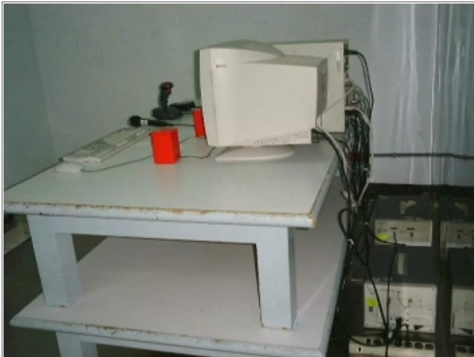
Conducted Emission Setup Photos (Worst Emission Position)