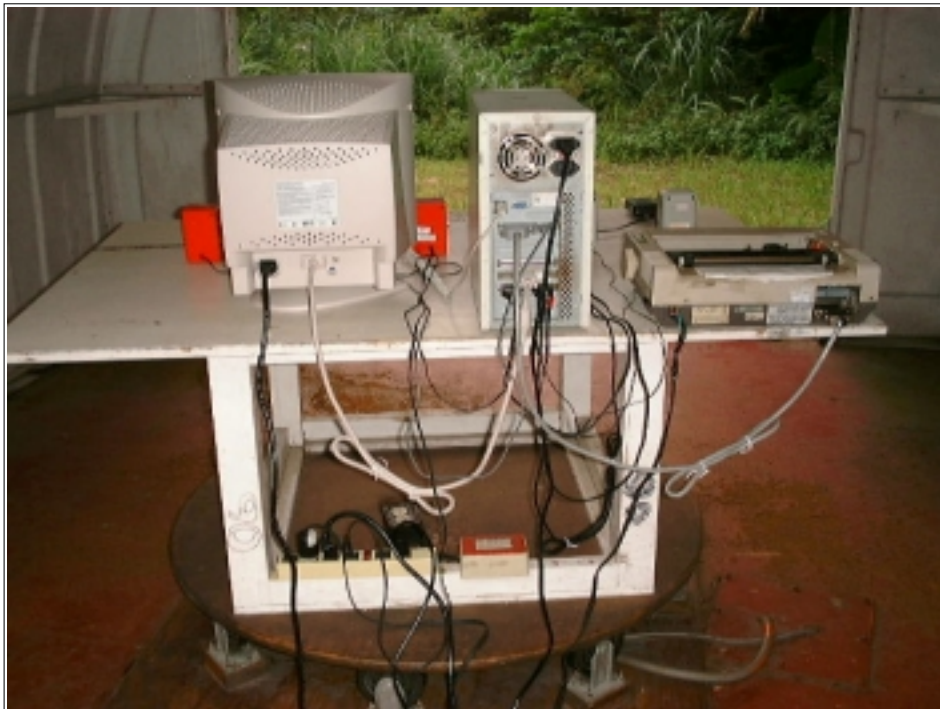
Radiated Emission Setup Photos (Worst Emission Position)