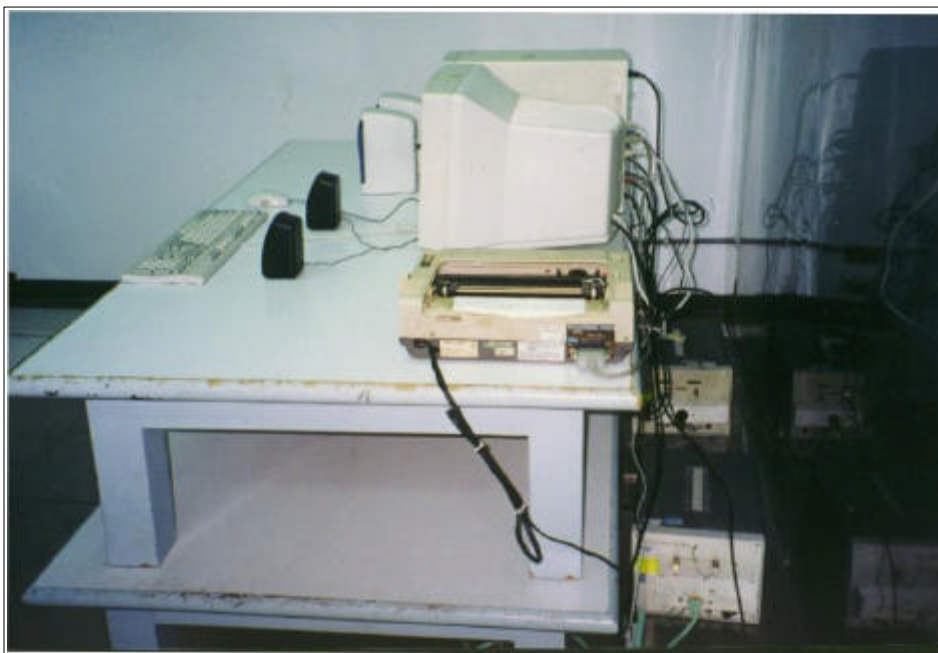
Conducted Emission Setup Photos (Worst Emission Position)