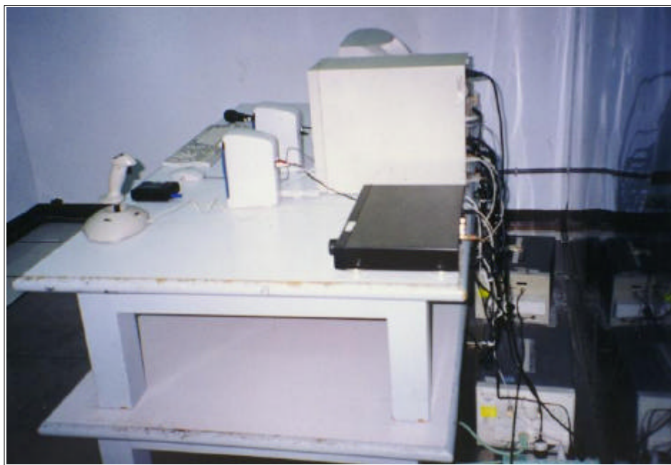
Conducted Emission Setup Photos (Worst Emission Position)