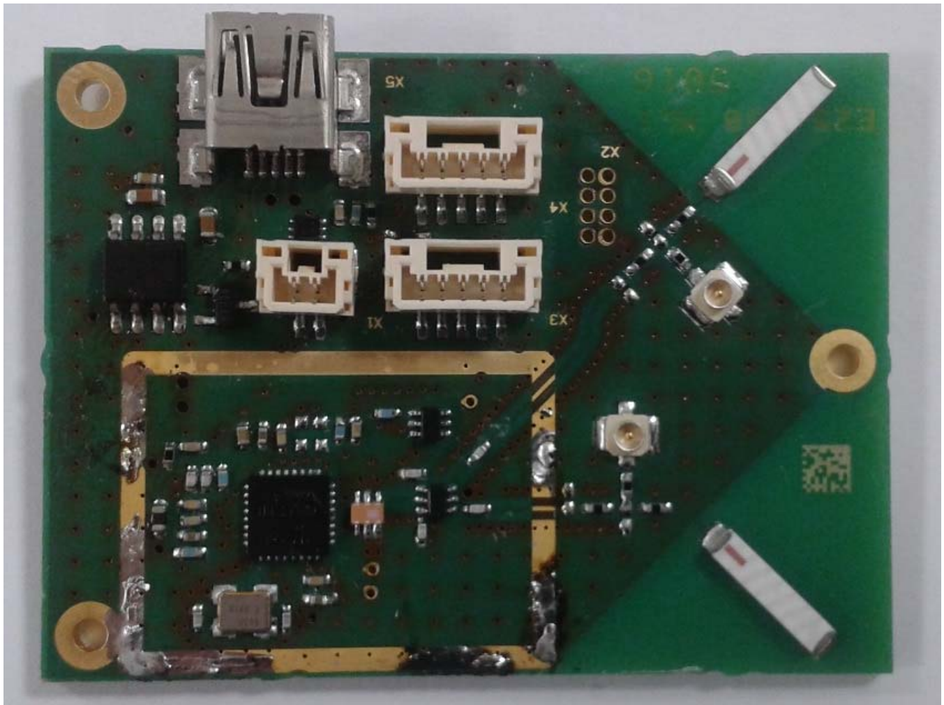
Side 1 Shield Removed