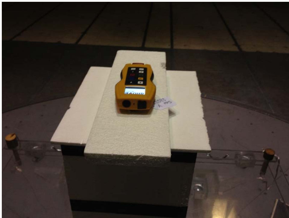
Radiated Emissions to 18 GHz; Power, Spurious; Back