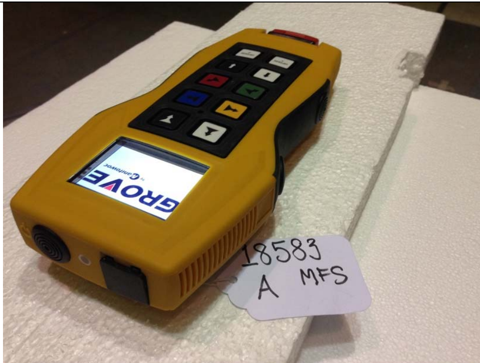
Radiated Emissions to 18 GHz; Power, Spurious