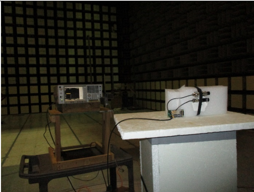
Radiated Emissions to 26.5 GHz