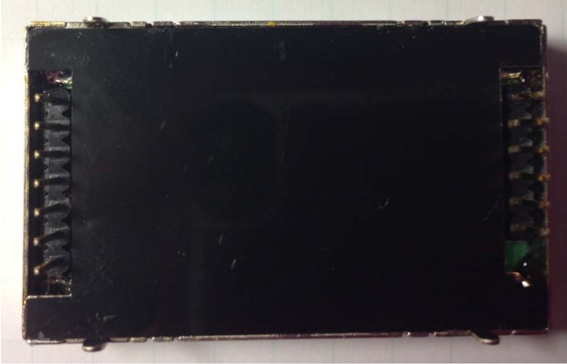
Figure 6, Side 6 / Bottom