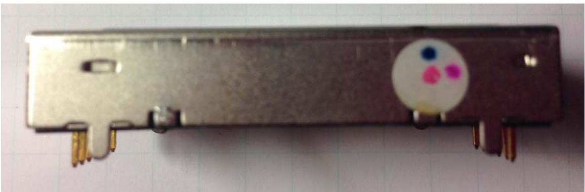
Figure 5, Side 5