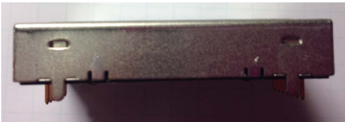
Figure 2, Side 2