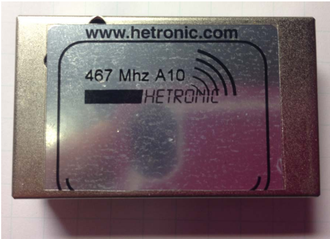
Figure 1, Top / Side 1