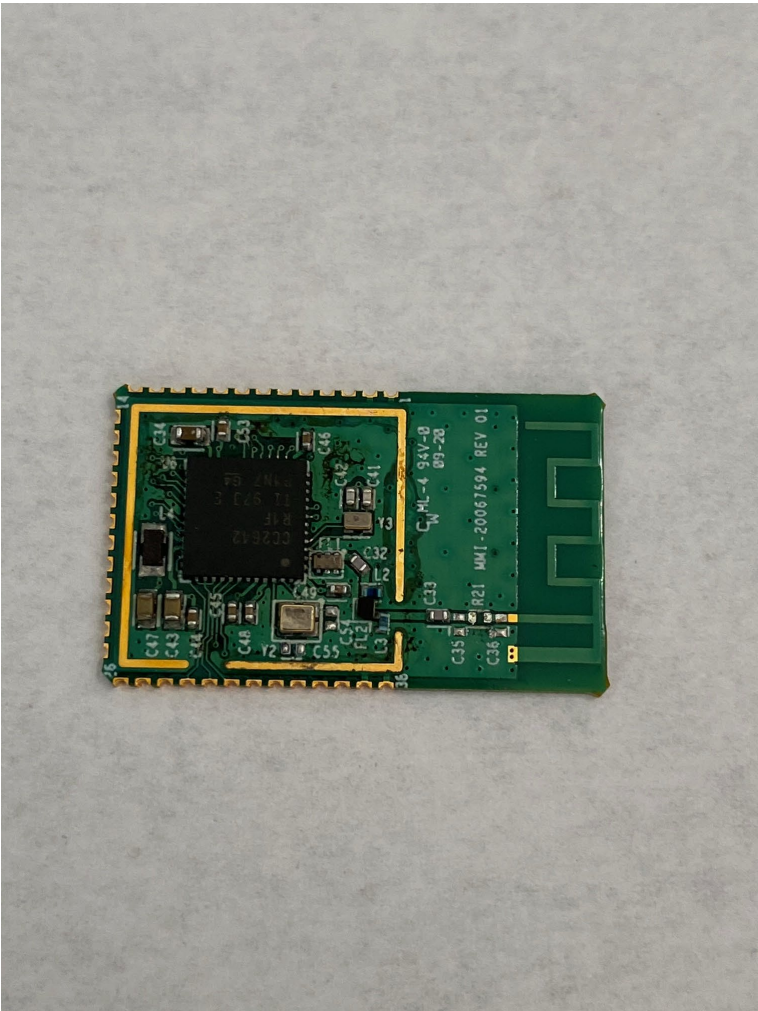
Module without can