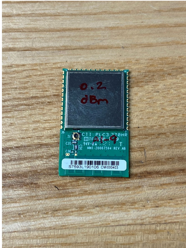
Module with can