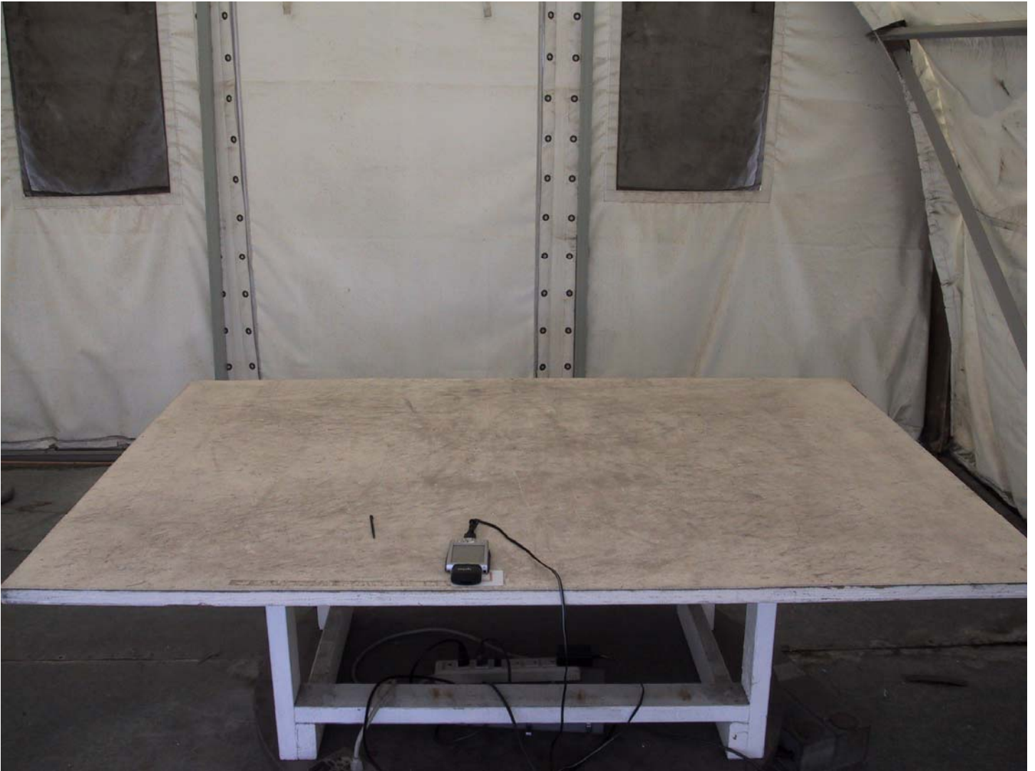
Radiated Emissions Test Setup