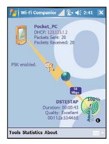
Graphical main screen

Socket Wi-Fi Companion is a powerful and easy-to-use utility that greatly enhances you Wi-Fi experience. Intuitive graphics and handy tools make it simple to connect to and manage wireless networks.