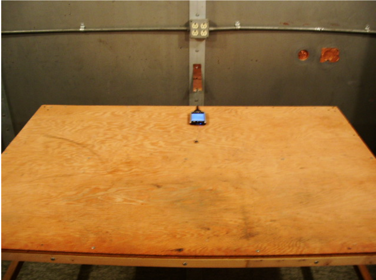
Line Conducted Emissions Setup