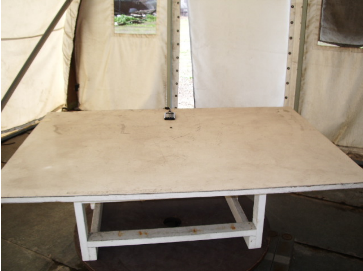
Radiated Emissions Setup