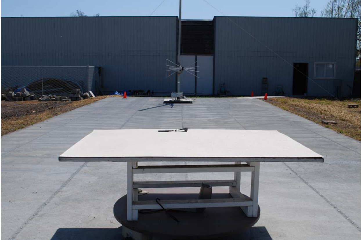
Radiated Emissions Setup