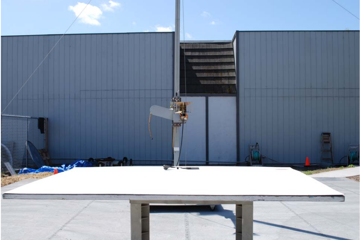
Radiated Emissions Setup above 1 GHz