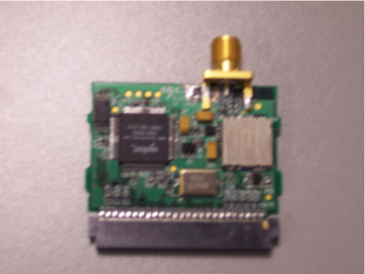
EUT PCB – Component Side