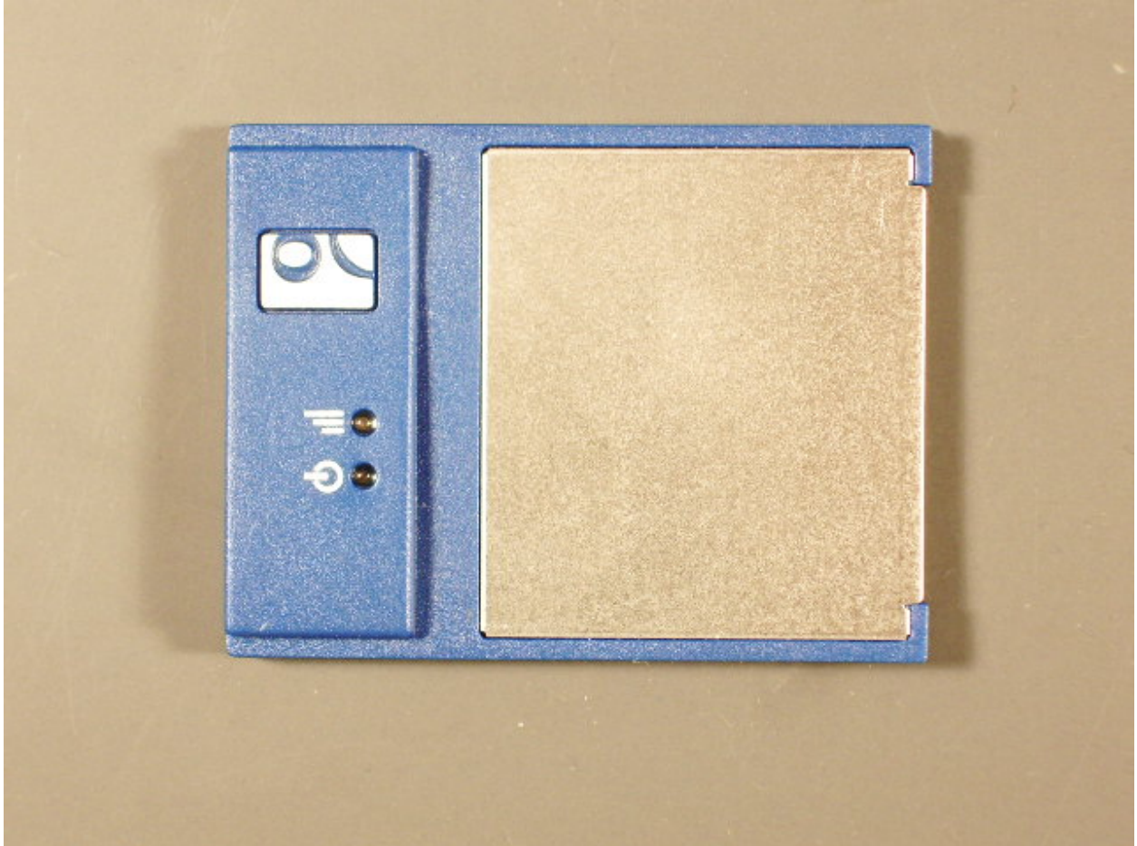
PCB – Top View