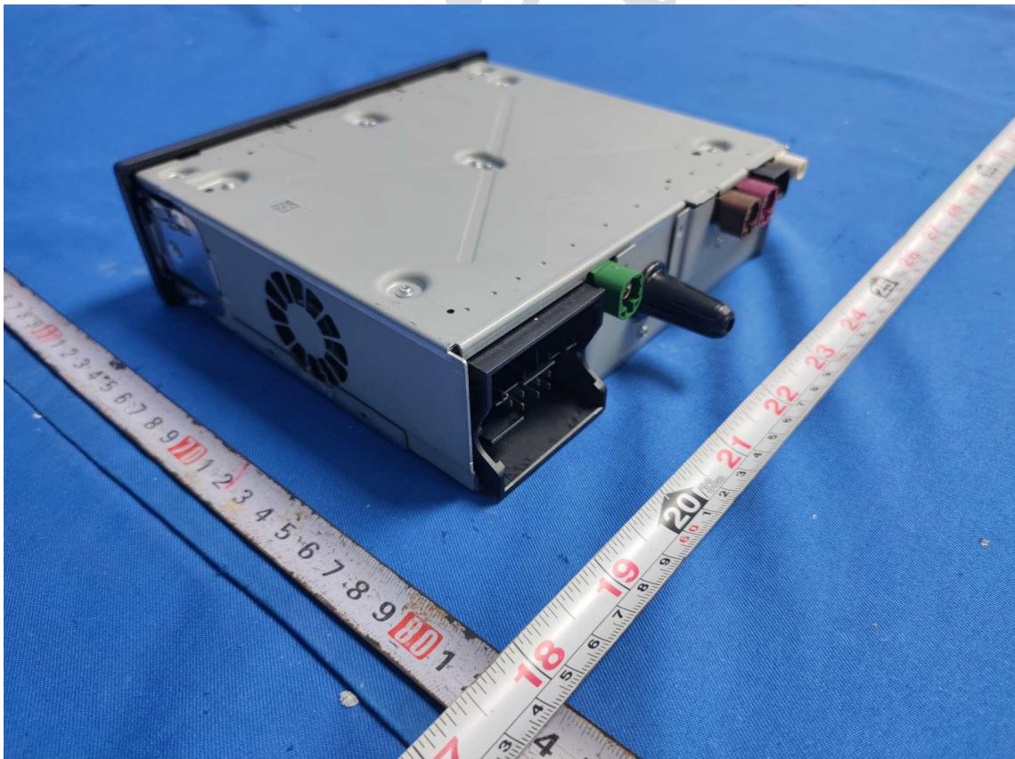
Fig.2 - Overview (2)