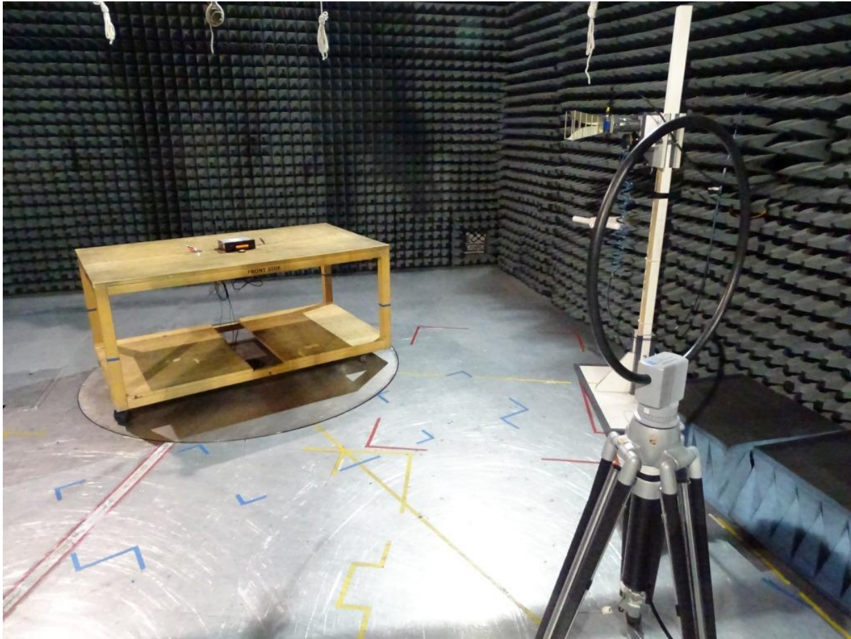
Photo 1: Test setup for radiated measurements (Enclosure, below 30 MHz, intentional radiator §15.209, ANSI C63.10)