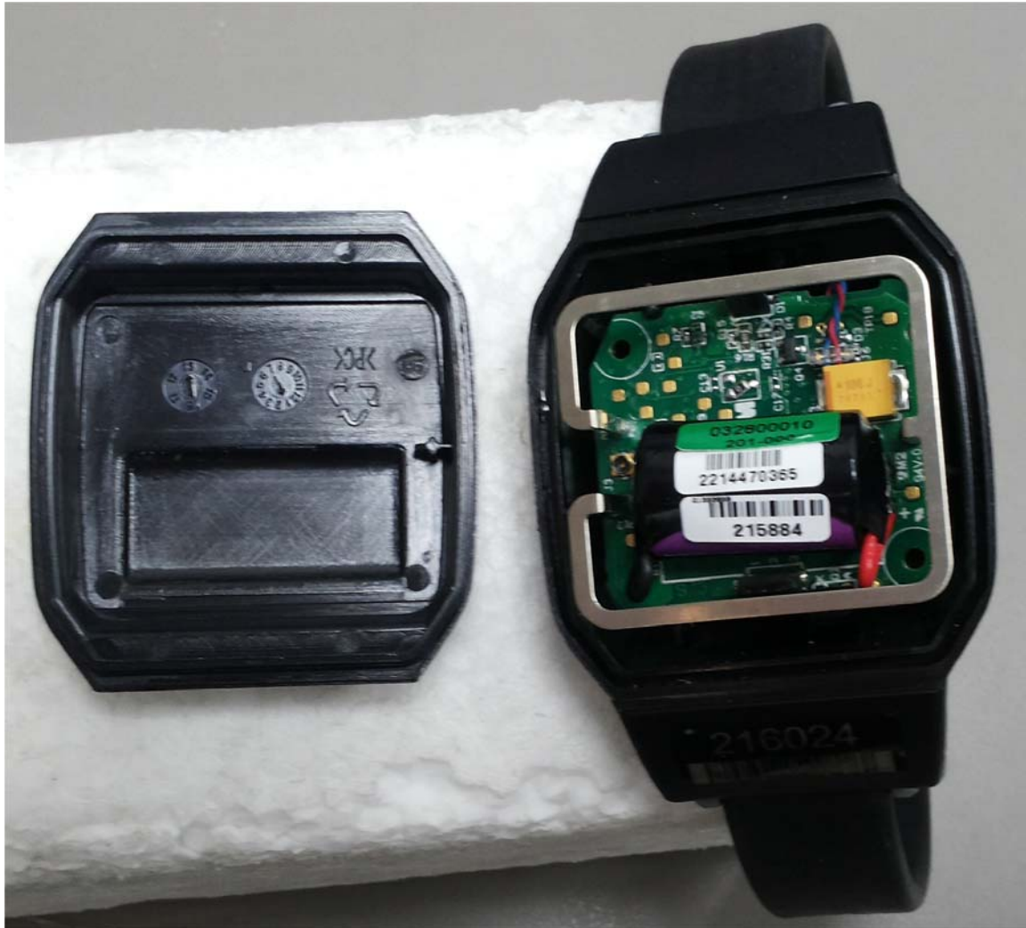
Photograph No.1 Tracking Bracelet internal view