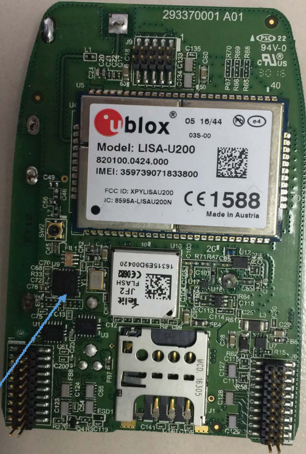
CC1101 chipset location on RF Board