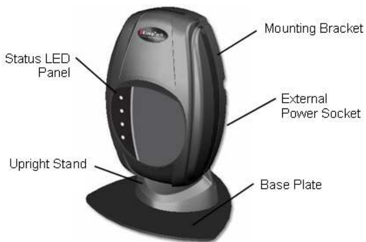
Figure 1 Home Unit