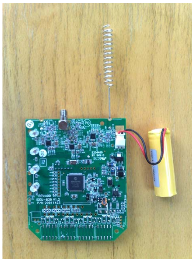
Figure 2: PCB (Top)