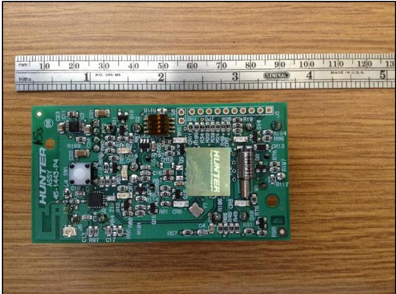
Photograph 12: PCB Front with Shield