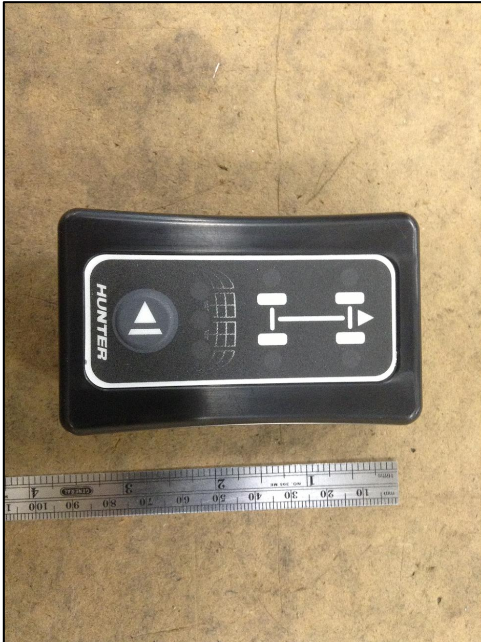
Photograph 11: Sample Host