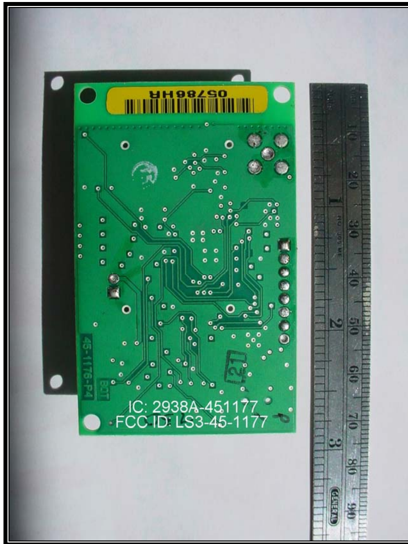
Photograph 1: ID Label & Location