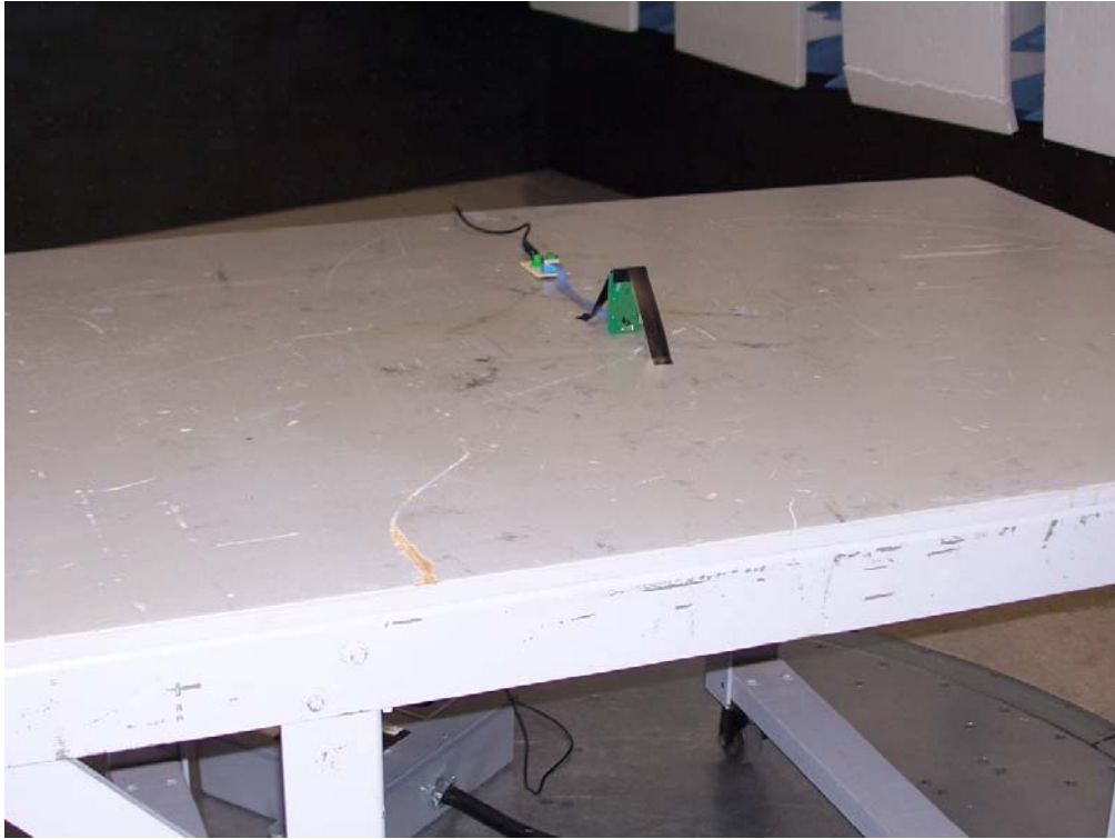
Figure 1 - Radiated Emissions, Band Edge Compliance, and Voltage Variations vs. Frequency Stability Test Setup (Chamber - Front)