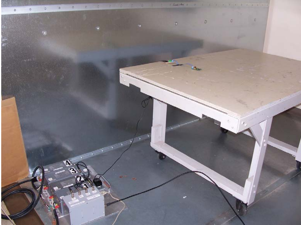
Figure 3 - Conducted Emissions Test Setup