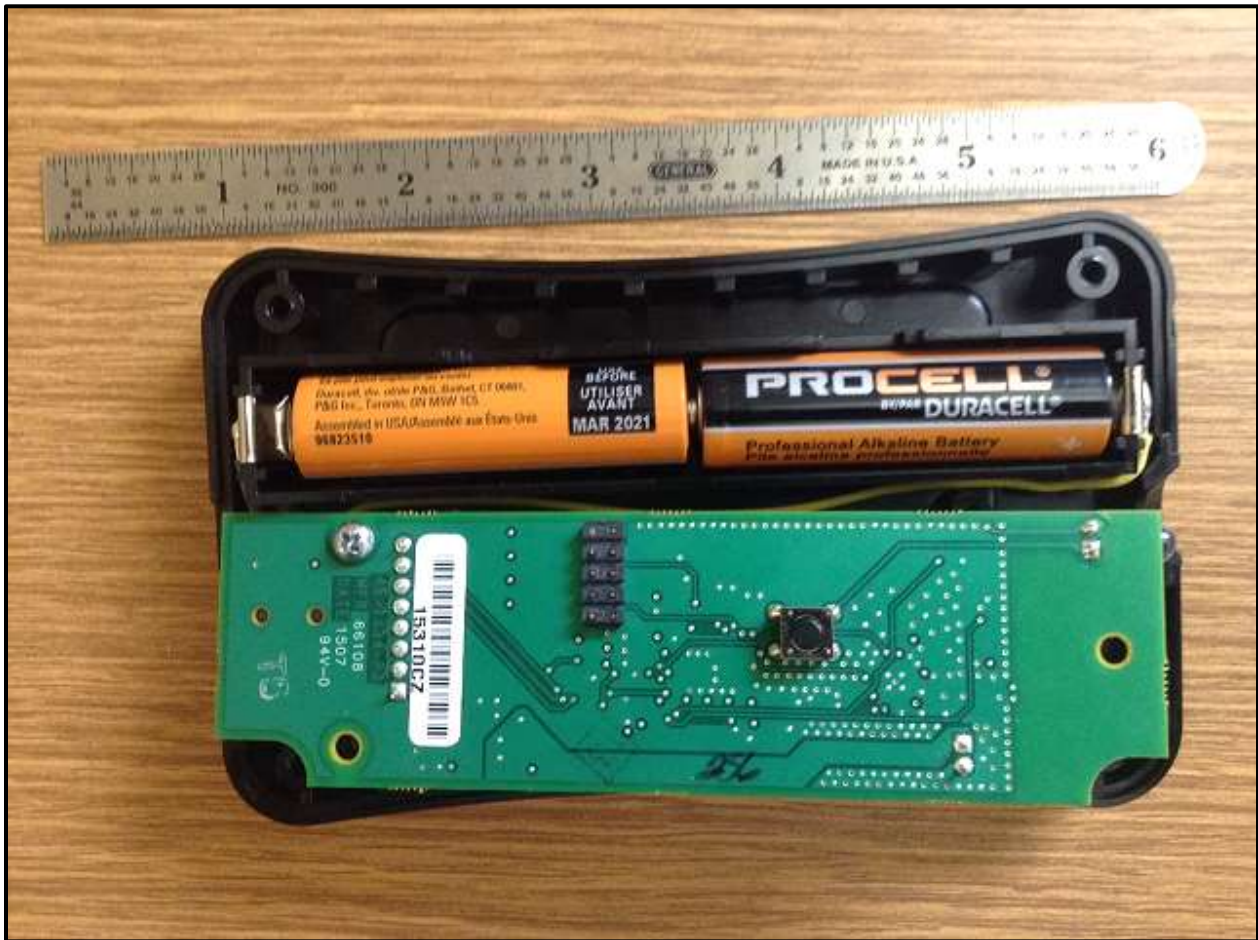
Photograph 5: Assembly