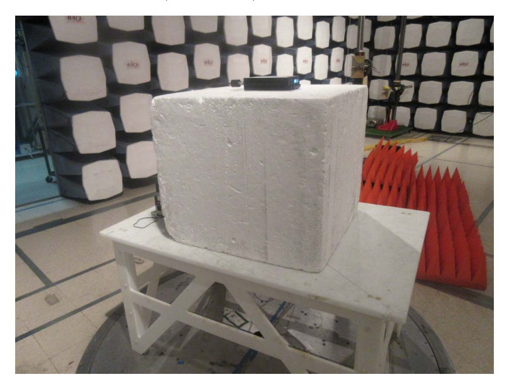
Radiated\ Emission\ above\ 1GHz\ (SVR\text{--}300UA)-Rear\ View

Radiated Emission above 1GHz (SVR-300UA) – Front View