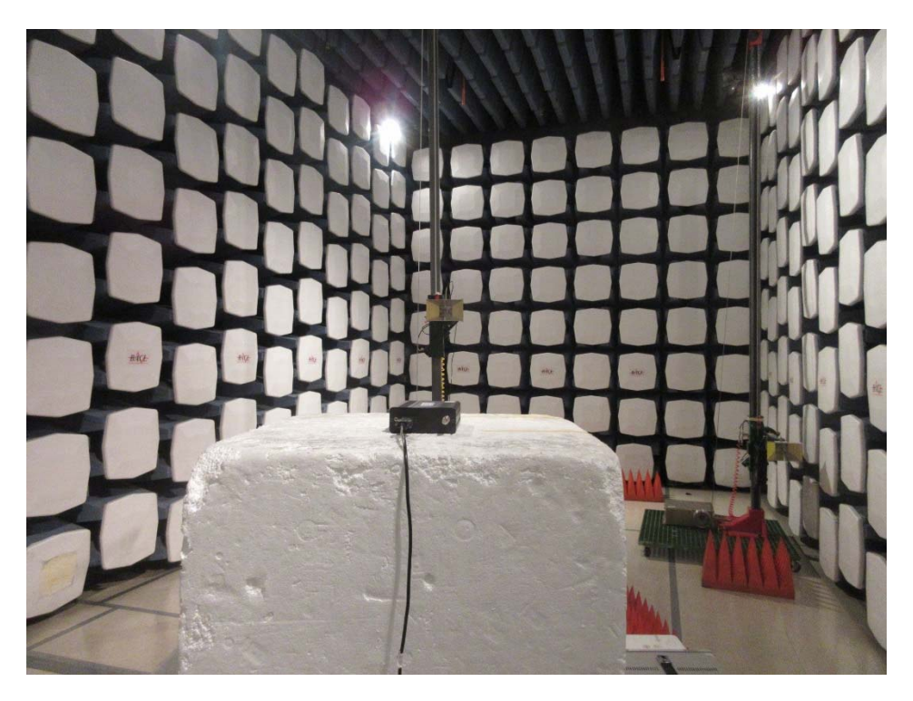
Radiated\ Emission\ above\ 1GHz\ (SVR\text{-}300M)-Rear\ View

Radiated\ Emission\ above\ 1GHz\ (SVR\text{--}300M)-Front\ View